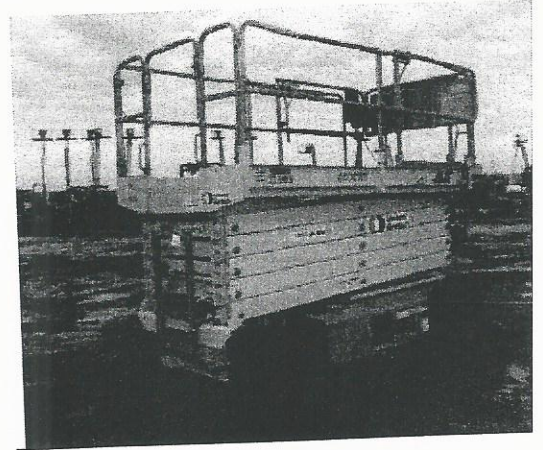
Viewing Photo 5 of 5

© 2007-2016 RitchieSpecs Equipment Specifications Ritchie Bros. Auctioneers © | Terms of Use | Privacy Statement OEM specifications are provided for base units. Actual equipment might vary with options.